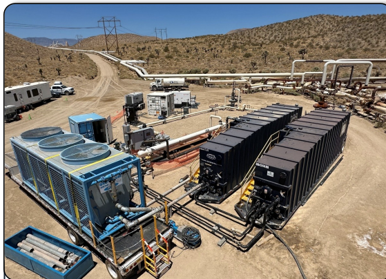
3,000hr Commercial Demonstration First demonstration of water-independent closed-loop system at commercial geothermal conditions & scale (Coso/NAWS China Lake, CA)