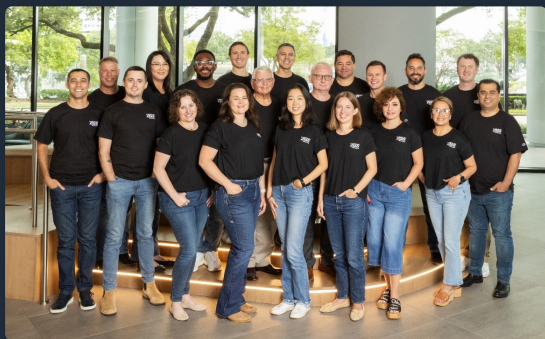
XGS Energy, Inc.

25 FTEs and growing with extensive subsurface engineering, 10+ GW U.S. renewables development experience