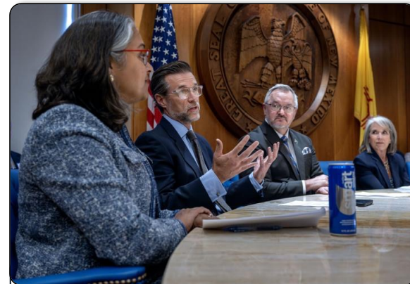
150 MW Meta New Mexico Agreement Agreement to deliver 150 MW to PNM grid to support Meta's data center operations, 10x the existing geothermal capacity in the state